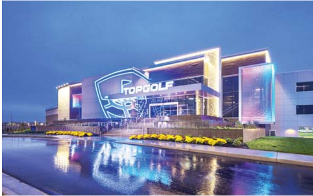
Topgolf of Fishers opened in Fall 2017