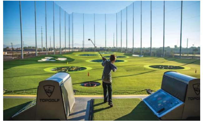
Topgolf is enjoyable for all ages and abilities