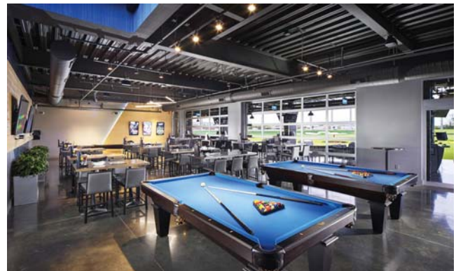
Climate-controlled facility & amenities close to play