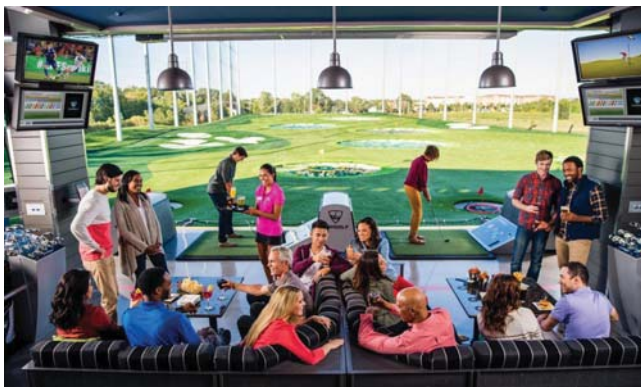
Exciting games competing as individuals and teams