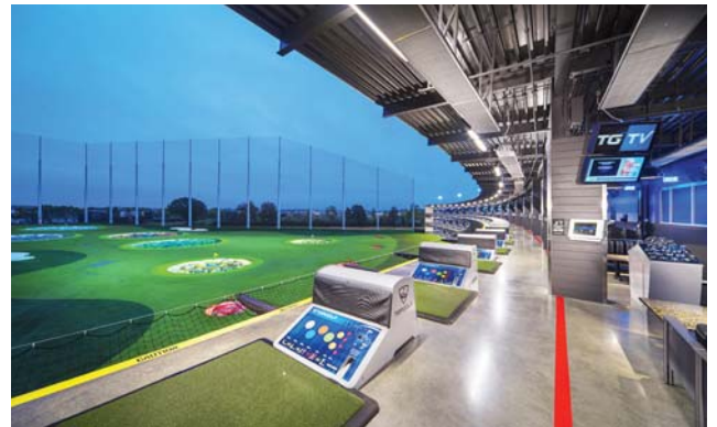
Computerized scoring in each bay